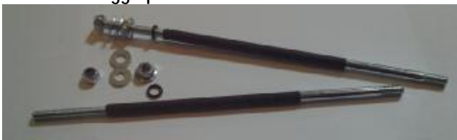
Gigglepin Extended Motor Bolts